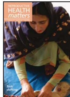
No.33 Task shifting