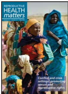
No.31 Conflict and crisis settings