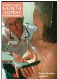
No.32 Reproductive cancers